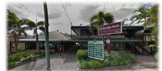
Bellacraft Wellness Centre in historic Mudgeeraba set in the Gold Coast hinterland